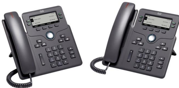
Figure 1. Cisco IP Phone 6800 Series: 6841 (left) and 6851 (right)

The line keys on each model are fully programmable. You can set up keys to support either lines, such as directory numbers, or call features, such as speed dialing. You can also boost productivity by handling multiple calls for each directory number, using the multiple-calls-per-line appearance feature. Tricolor LEDs on the line keys support this feature and make the phone simpler to use.